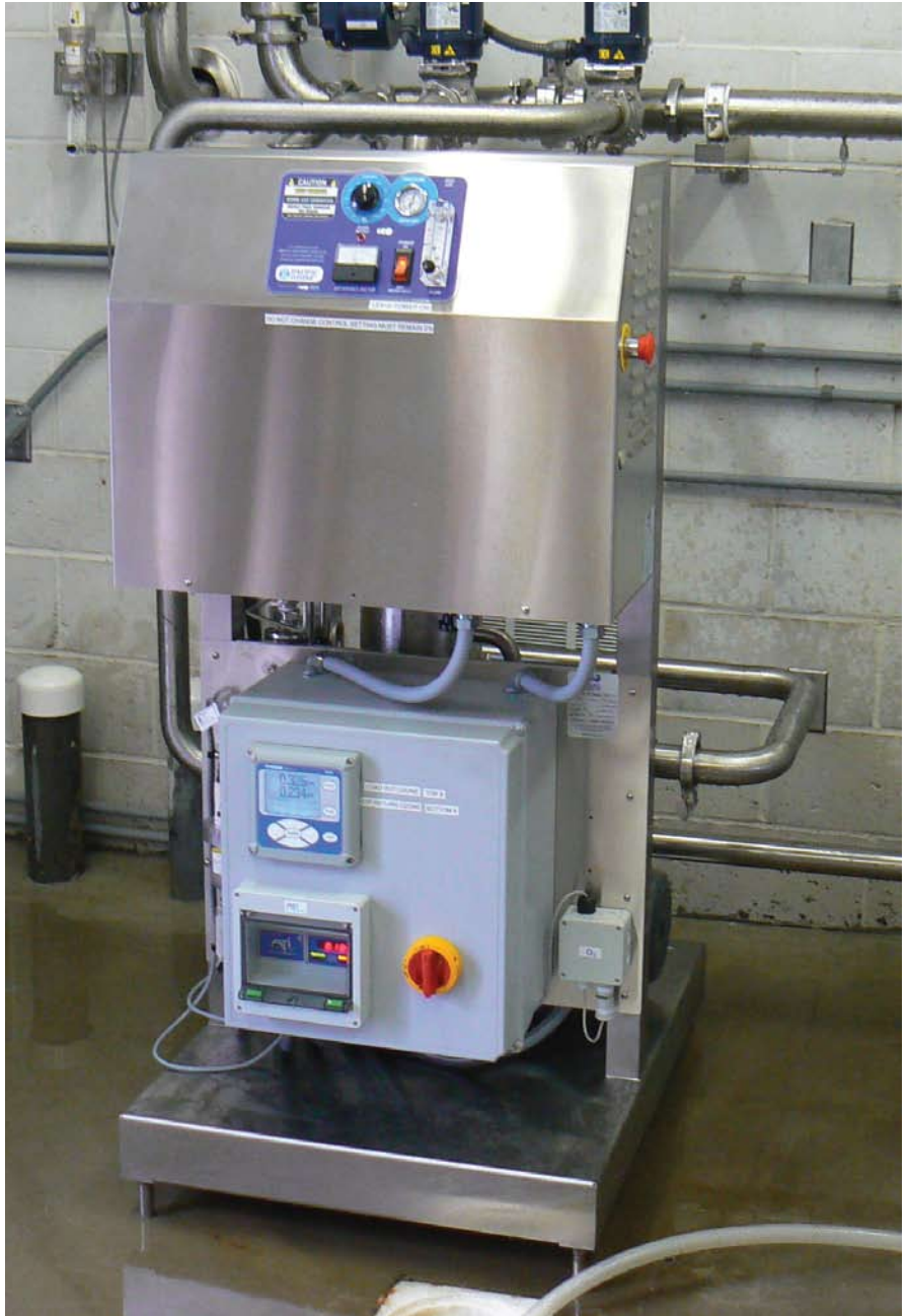
An SGC22 Ozone Generator System powers a Horizon 060 Integrated Ozone System at a remote spring water collection site.

The onboard oil-less air compressor of the SGC Series, provides needed compressed air to the system when plant air is unavailable or insufficient. The compressor feature allows the SGC Series generators to be installed in a wide range of locations and environments – wherever needed.