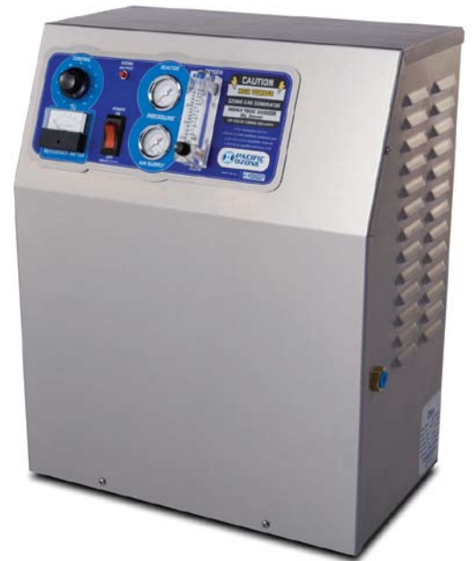
Model: SGA 11/21/22

including 0-100% variable power control, feed gas control, inlet air pressure and reactor back-pressure gauges; power supply feedback reference meter; and LED ozone production indicator. The control interface includes 4-20mA or 0-10VDC input signal for 0-100% variable ozone concentration control.