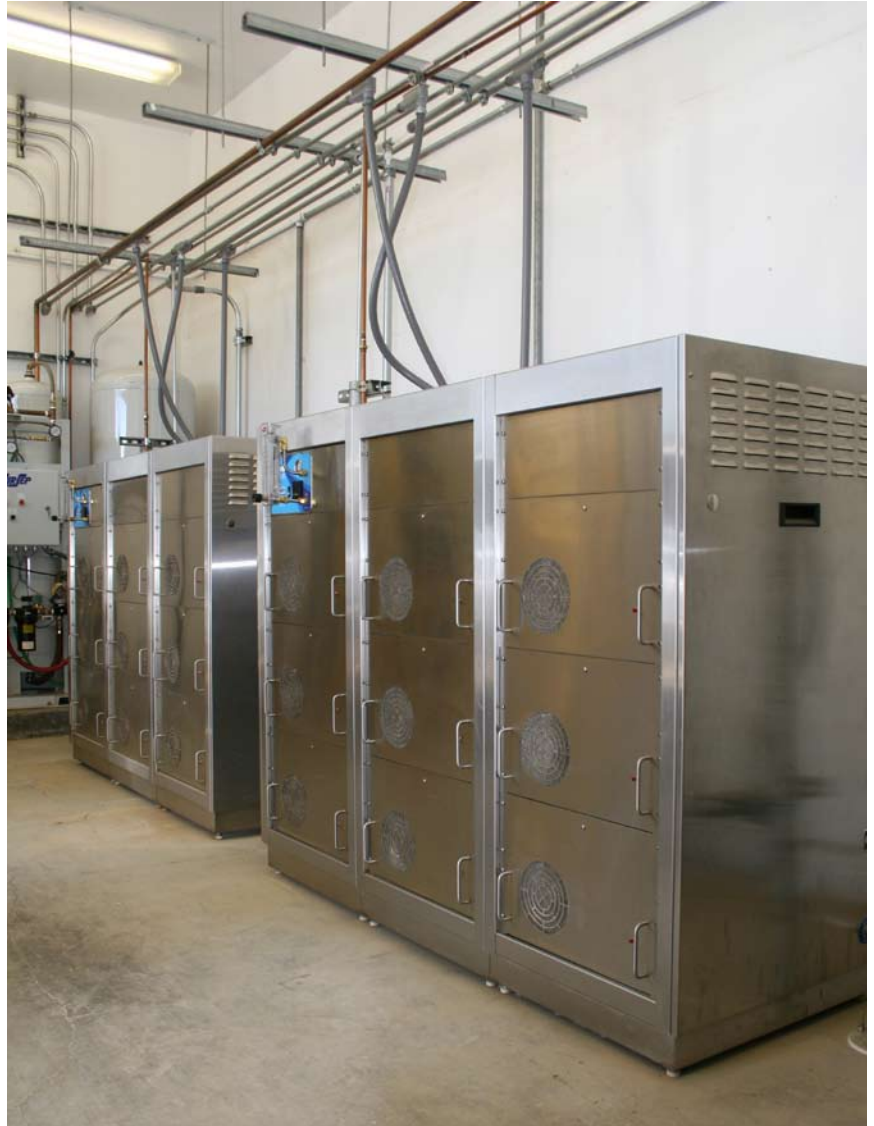
Model: 9M24 Ozone Generator System

The powerful M Series ozone generators help mutual water system operators meet increasingly stringent water quality regulations. For example, Pacific Ozone designed and installed an ozone system to serve a 720-home resort community at Clear Lake, California.