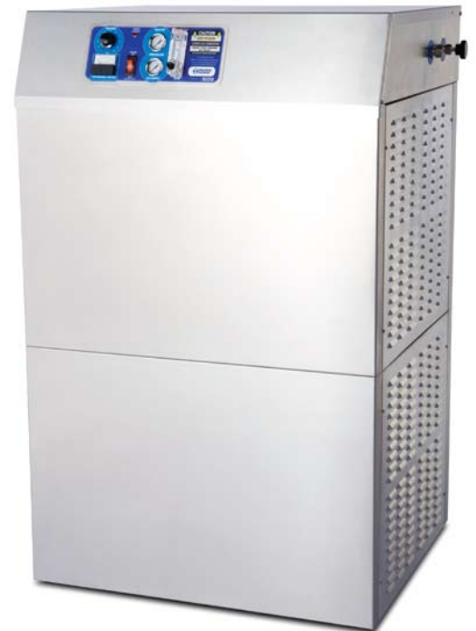
Model: Large SGA53/63/64

power control, feed gas control, inlet air pressure and reactor back-pressure gauges; power supply control signal reference meter; and LED ozone production indicators. The control interface includes 4-20mA or 0-10VDC input signal for 0-100% variable ozone concentration control.